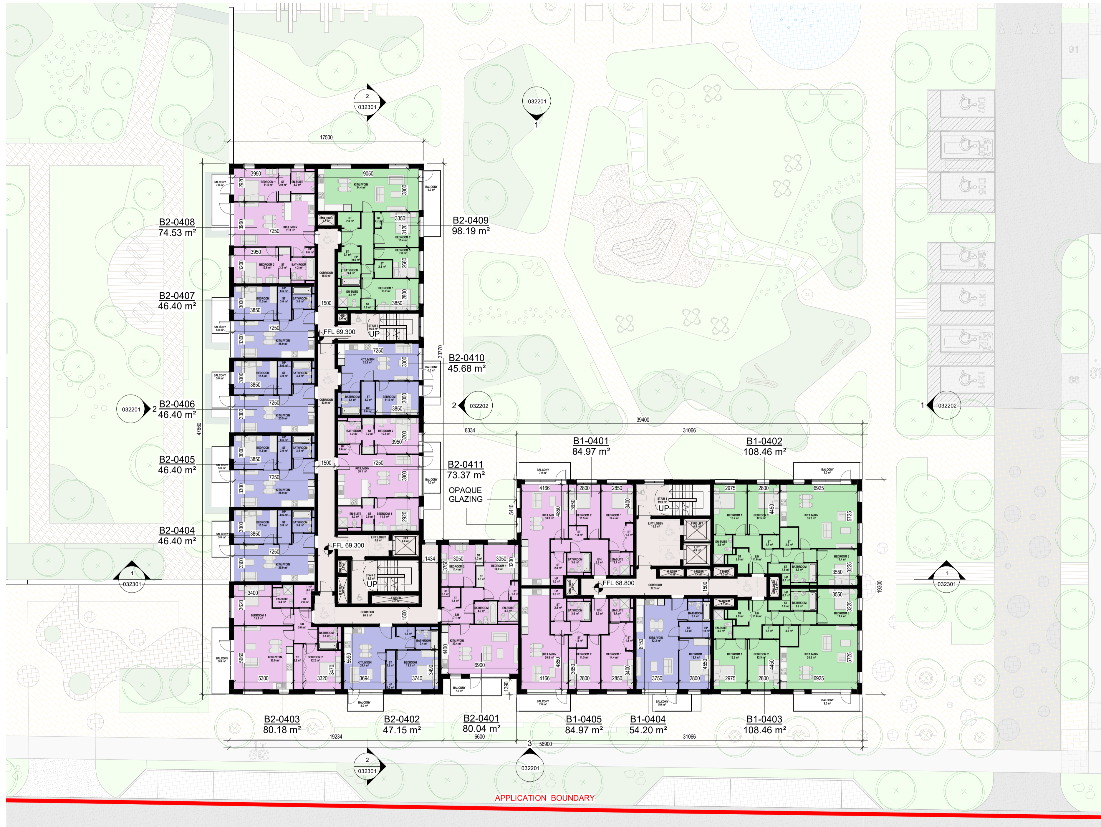
1 BLOCK B -L04-FOURTH FLOOR PLAN

Please consider the environment before printing this sheet